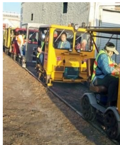
Another shot of the cars leaving Winter Garden.