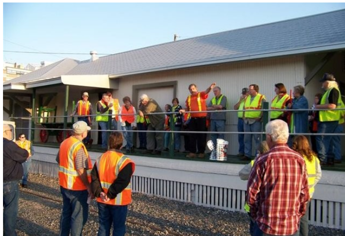
Safety meeting at the motor car event