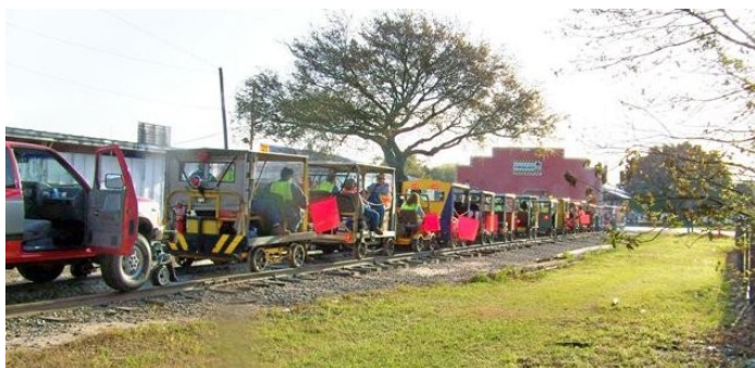
The caravan of motor cars, bound for Tavares, departed Winter Garden Saturday morning about 8:30.