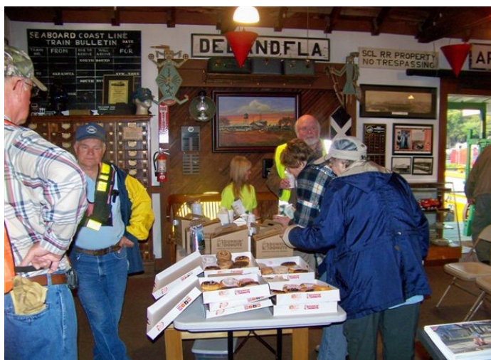
Scene in the Railroad Museum as motor car operators and guests enjoyed refreshments prior to the run.