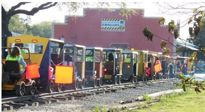
The cars are ready to roll on down the line!